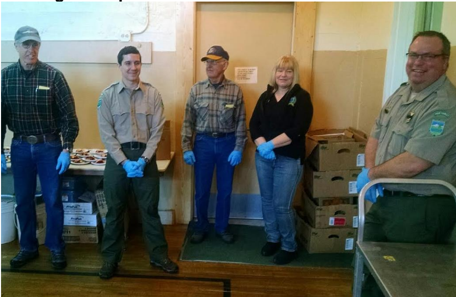
Helping was always better than check writing.