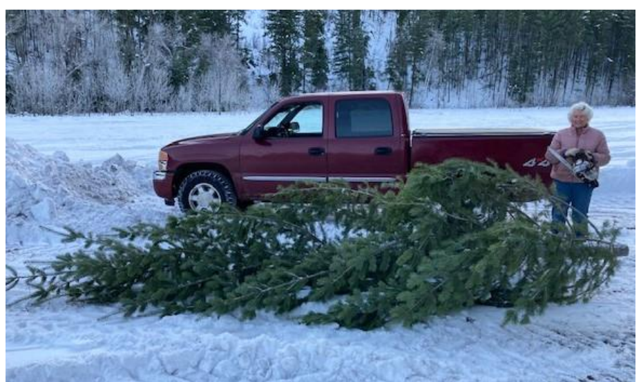
Normally the crew will search the forests for a huge tree for the Barn and a nice large tree for the City of Winthrop. This year the Barn is locked up and the large snowfall kept us out of the backwoods. Thankfully Bill and Suellen White came through and we were able to provide the city with a nice tree. Good job crew.